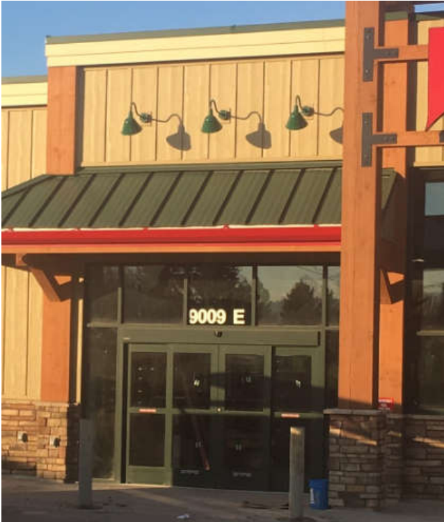
White numbers on glazing are a better contrast.