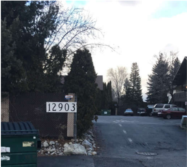
A standalone sign at the entrance is always a good choice.