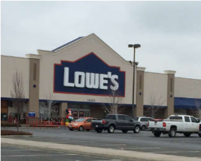
Numbers are small and difficult to see from the street.