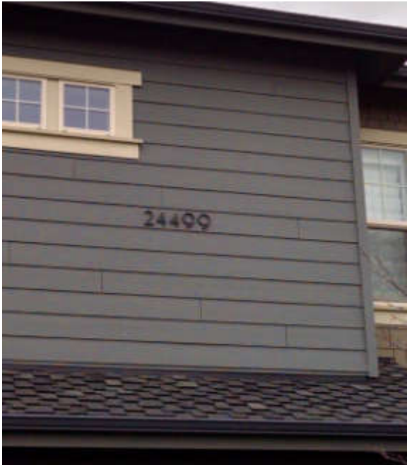
Address color is not a good contrast from the building color.